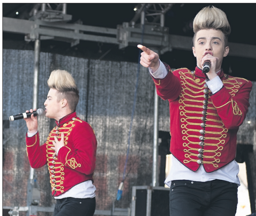
Jedward playing in Ballybunion last week.